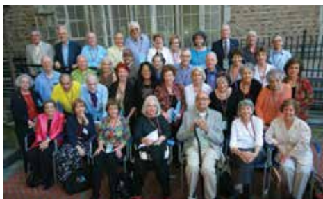
Music & Art, Class of 1954