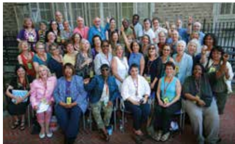
Music & Art, Class of 1969