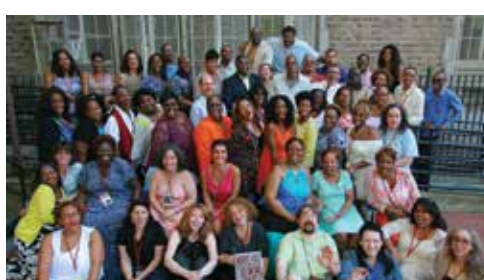
Music & Art, Class of 1984