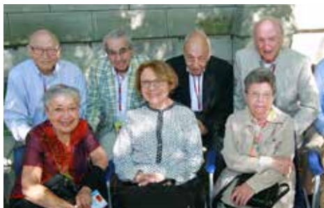
Music & Art Founding Alumni