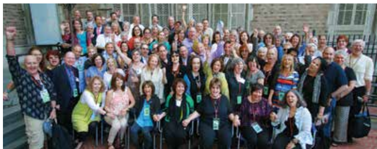
Music & Art, Class of 1964