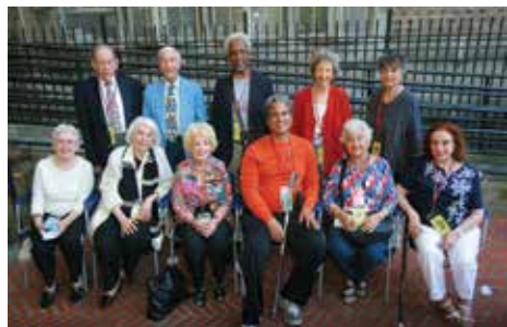
Music & Art, Class of 1946