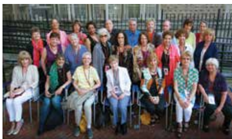
Music & Art, Class of 1959