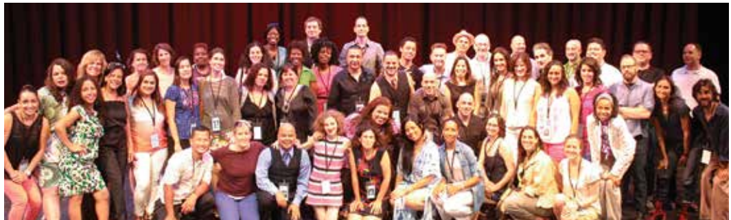
LaGuardia, Class of 1989