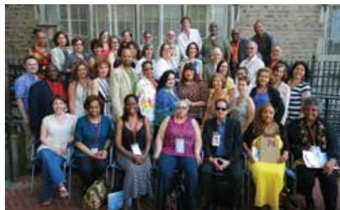
Music & Art, Class of 1974