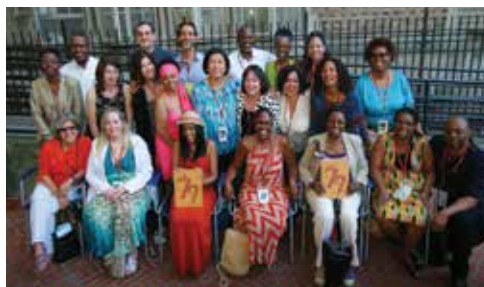
Music & Art, Class of 1979