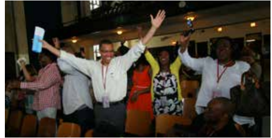
Celebration in the auditorium at the castle.

Nearly 400 alumni from Music & Art met up at the castle on June 7th to celebrate their 30th to 75th anniversaries. Attendees included graduates from 1941 to 1984. The joyous day featured a tour, drinks and hors d'oeuvres on the terrace, a delicious dinner in the cafeteria, and concluded with a trip to LaGuardia High School for the Semi-Annual Orchestra and Chorus Concert . The security guards said they had never seen so much hugging in the lobby.